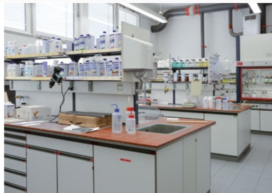
Research and development